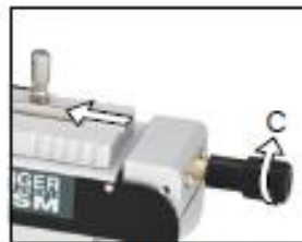
East/west adjustment is made via knob (C).

Place needle in its holder as close to the centre of the condenser as you can by eye. Ensure the needle is perpendicular.