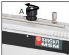
Clamp the tool holder in place using the black clamp knob (A). Fine adjustments can now be made to centre the needle.

The intensity control for the microscope lamp is located beneath the main table on the right of the lamp housing. There is also an iris-diaphragm below the condenser lens.