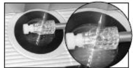
Place the tool holder in the Micromanipulator as shown.

Place the needle in the holder using the forceps provided. For very deep agar the needle can be secured in a low position for agar 5mm deep or less raise the needle 3mm from the base of the holder for best results.